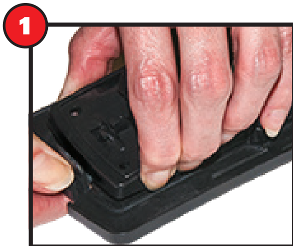
1 Pull outward on inside rear tab while lifting back of trap until back of trap is clear of clip on inside rear tab.