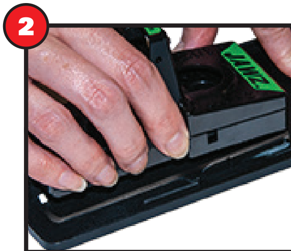
2 Hold middle of trap and twist to pull one side at a time out of the side clips.