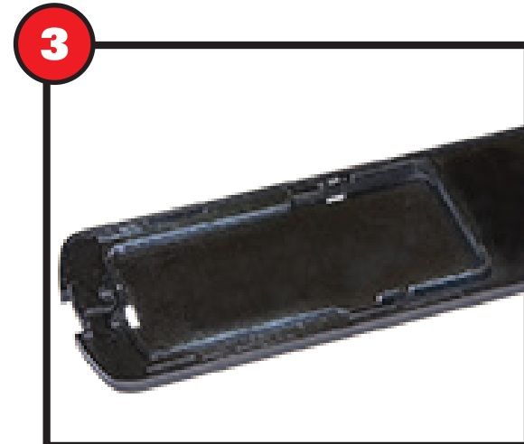
3 Remove trap from cover completely and dispose of trap properly. Cover is now ready for new trap.