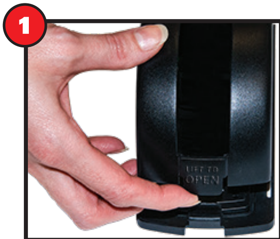
1 Pull outer rear tab to open JAWZ™ Depot cover.