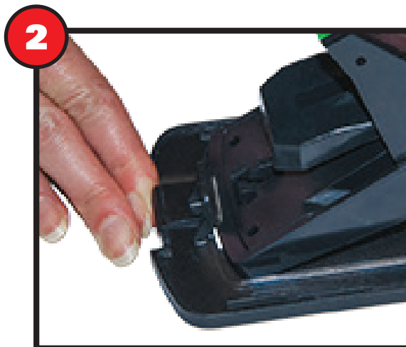
2 Insert trap by sliding the rear of trap firmly under the inside rear tab clip.